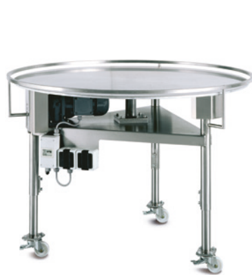
Optional: Revolving table Collects closed-up products.