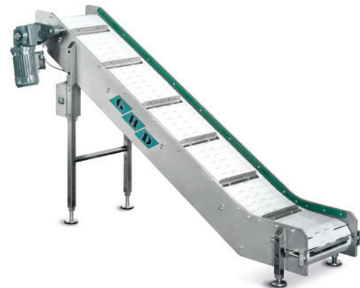
Optional: Inclined belt conveyor Transports closed-up products back to the work table level.

Optional: Silent compressor provides an independent compressed air supply.