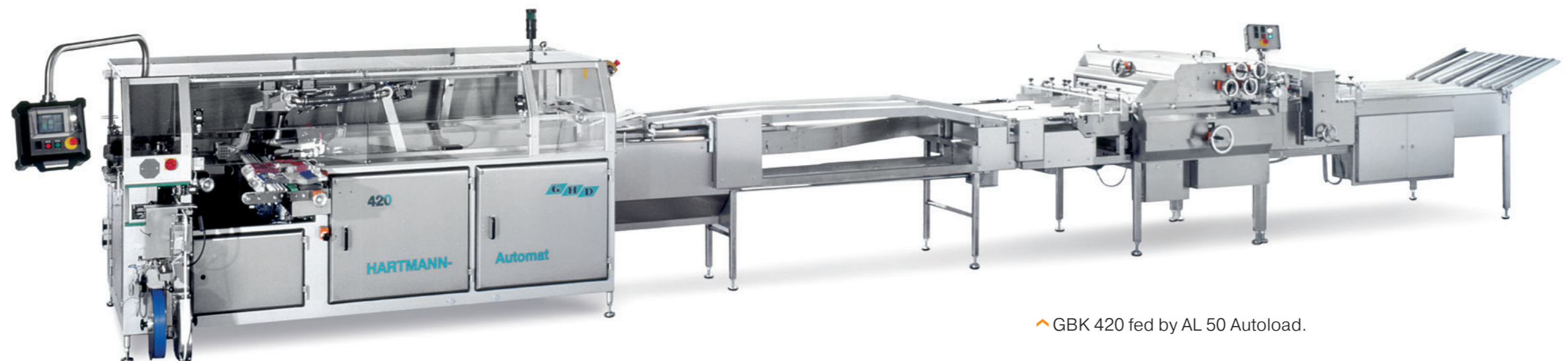
↗ GBK 420 fed by AL 50 Autoload.